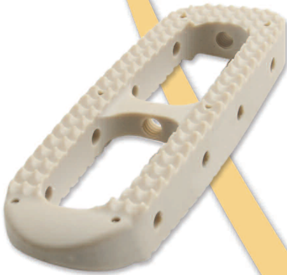
Bulleted Leading Edge